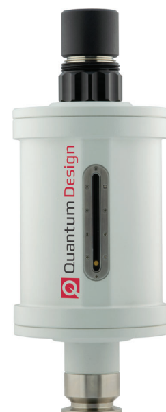
Linear Transport Motor